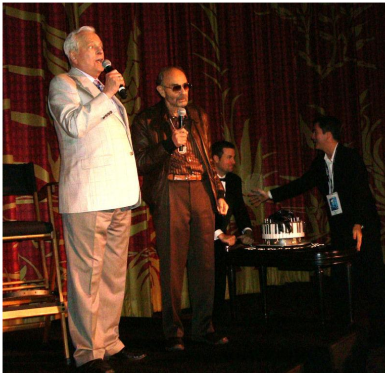
Turner Classic Movies host Robert Osborne introduces Stanley Donen , Grauman's Chinese Theatre, Hollywood, April 13, 2012, at the screening of Funny Face , in front of a crowd of one-thousand people. In honor of Donen's 88 th birthday that very day, he was presented with a cake decorated with the 88 keys of a piano.