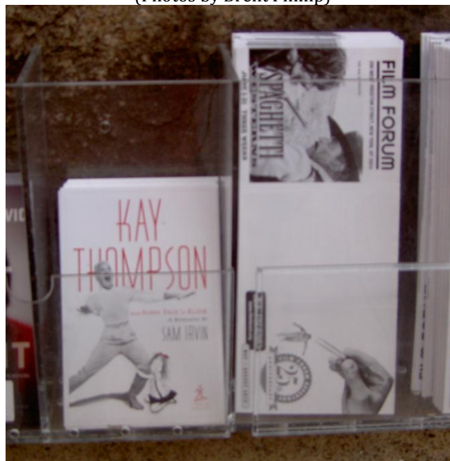
Alternate Funny Face display and flyer dispenser at Film Forum.